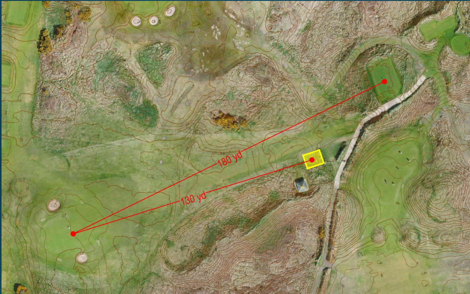
17 th Hole – New Gold Tee Location