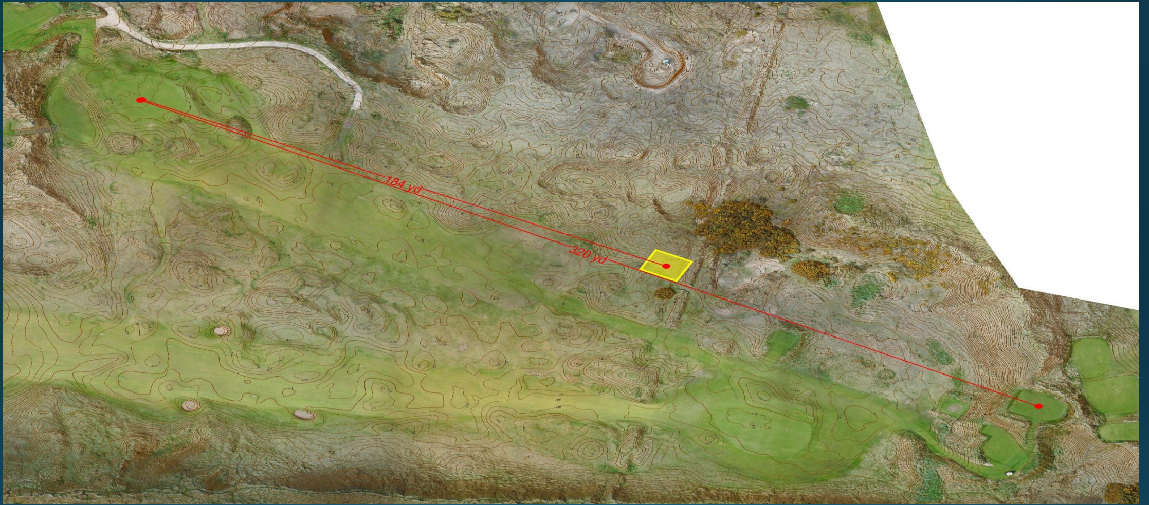
14 th Hole – New Gold Tee Box Location