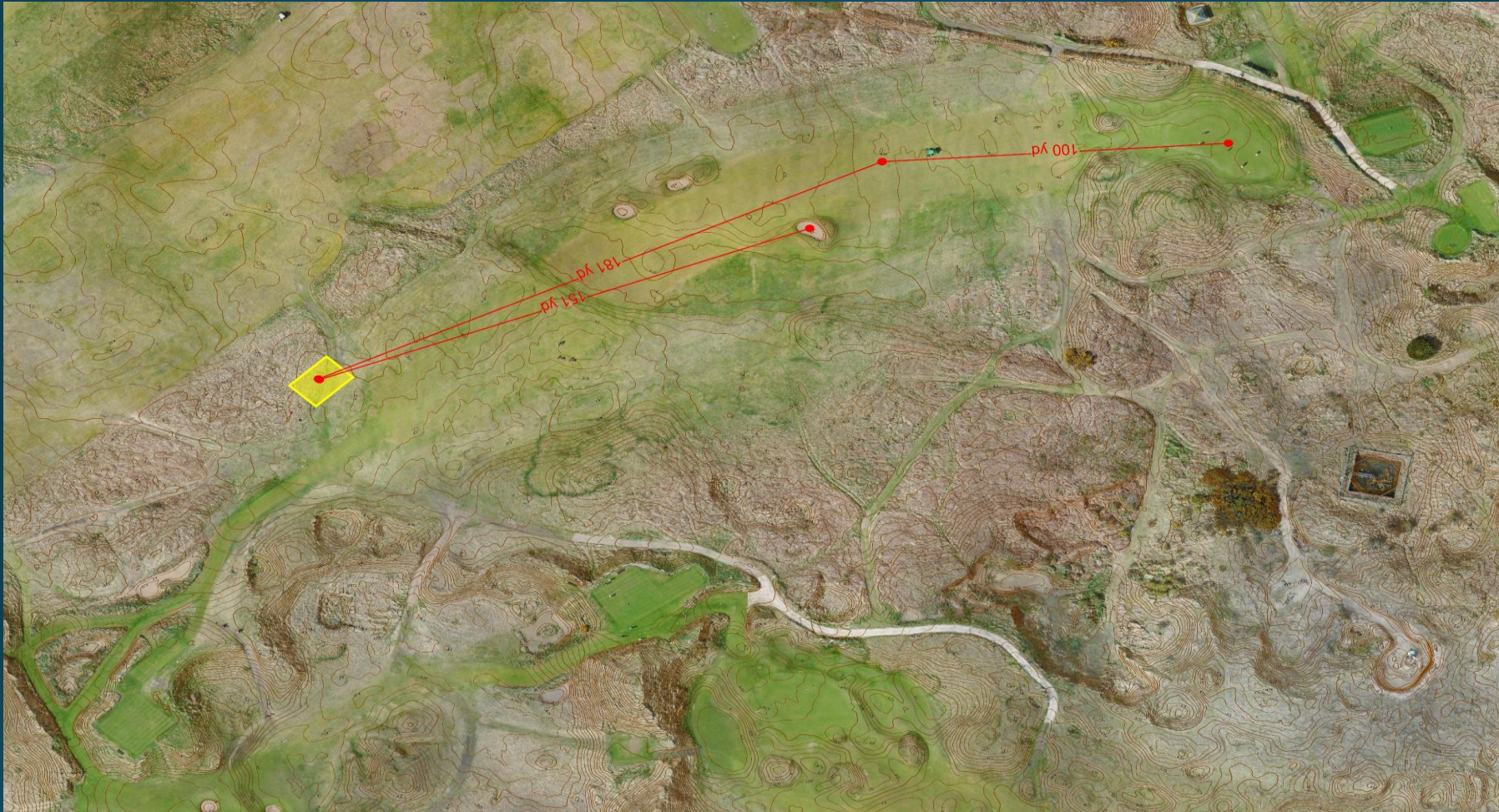
16 th Hole – New Gold Tee Location