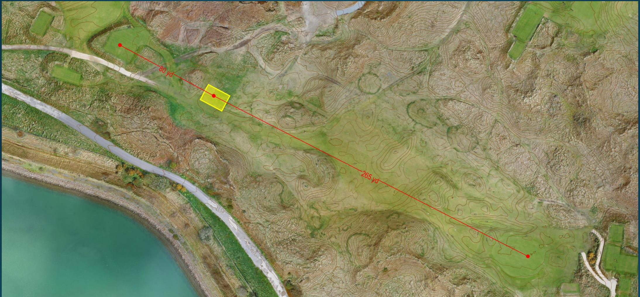
4 th Hole – New Gold Tee box Location