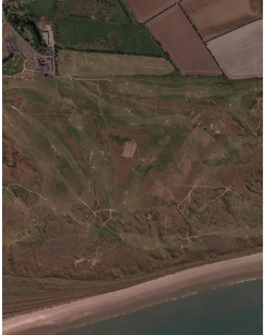
Baltray – May 2021