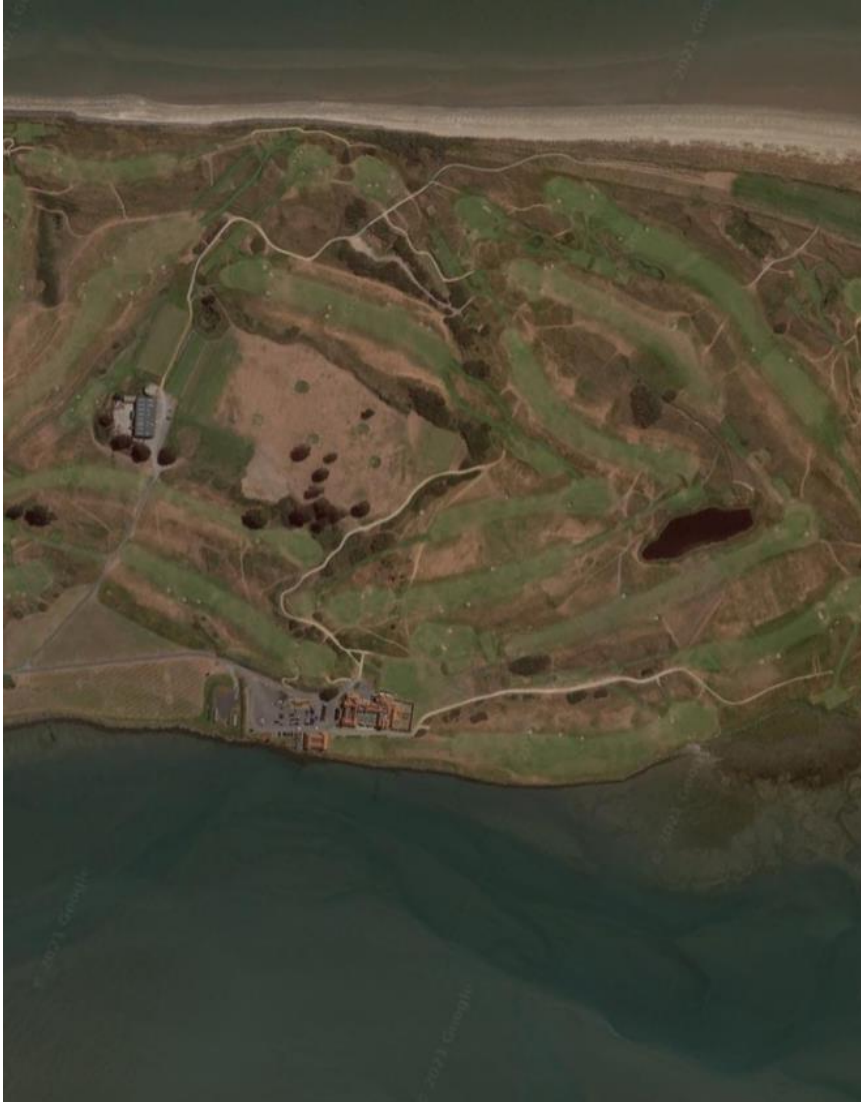
Portmarnock – May 2021

A satellite visual comparison of the positive impact produced by the modern Portmarnock Irrigation system on the left versus Baltray on the right